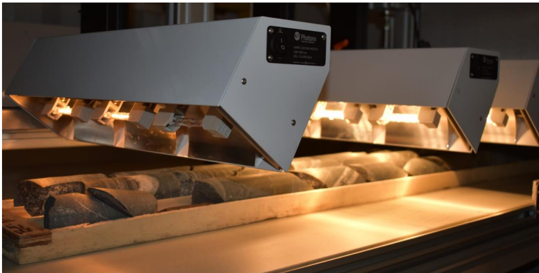
Figure 1. Drill core being scanned by hyperspectral cameras

The HSU project is a collaboration – led by College of the North Atlantic (CNA), and funded by ACOA (Atlantic Canada Opportunities Agency) via its Regional Economic Growth through Innovation (REGI) program, the Government of Newfoundland and Labrador, and by industry partners Iron Ore Company of Canada, and Agnico Eagle Mines.